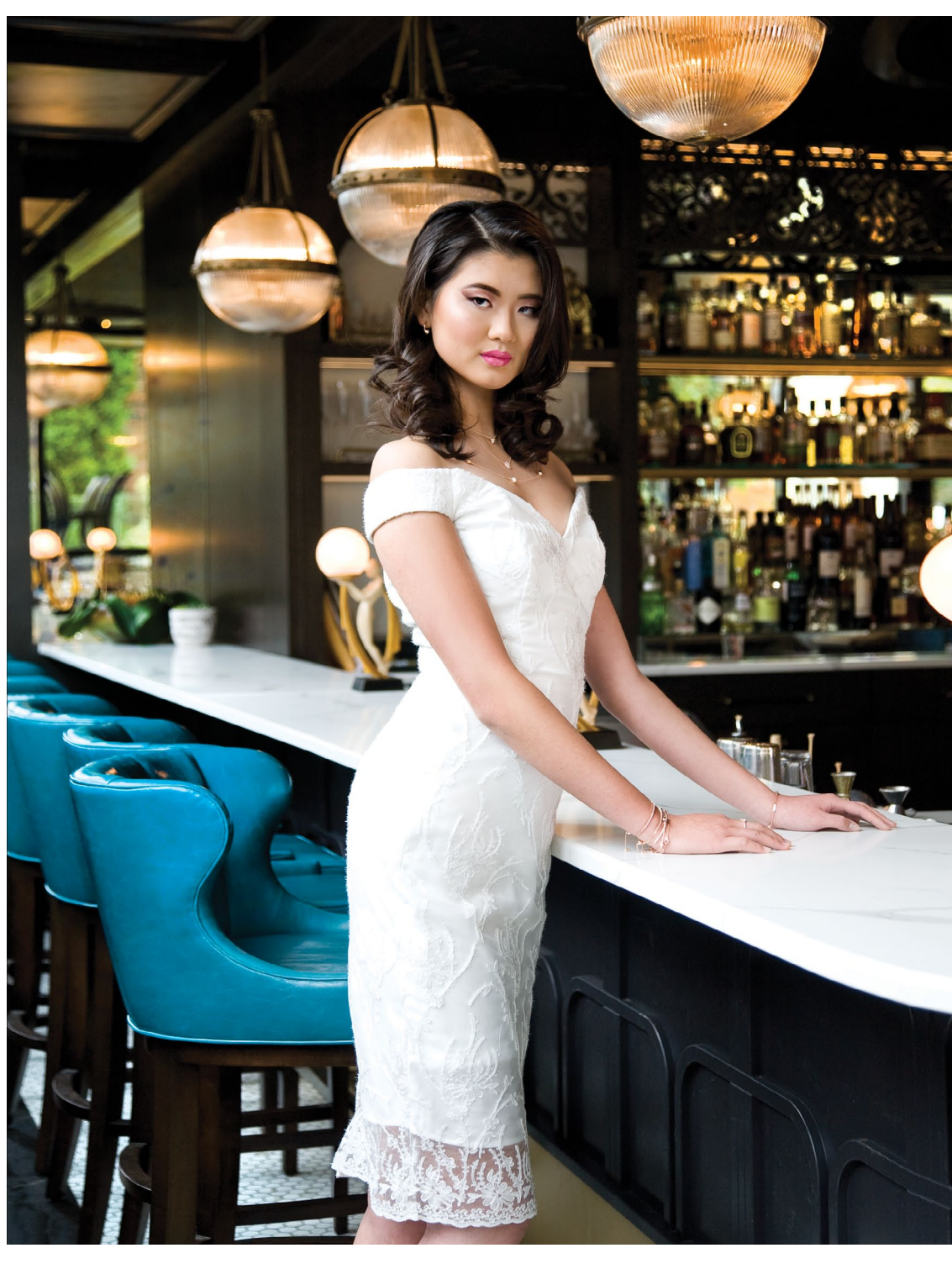
This page: White lace overlay cocktail dress, $350.

Jewelry: Pandora Contemporary Pearl Collection (necklace, earrings and ring), $100 to $250; Modern Love Pod Collection Rose bracelets, $130 each; Sparkling Strand Bracelets in Rose, $165 each; Vintage Allure Rose necklace, $140; Classic Elegance Rose necklace, $165.